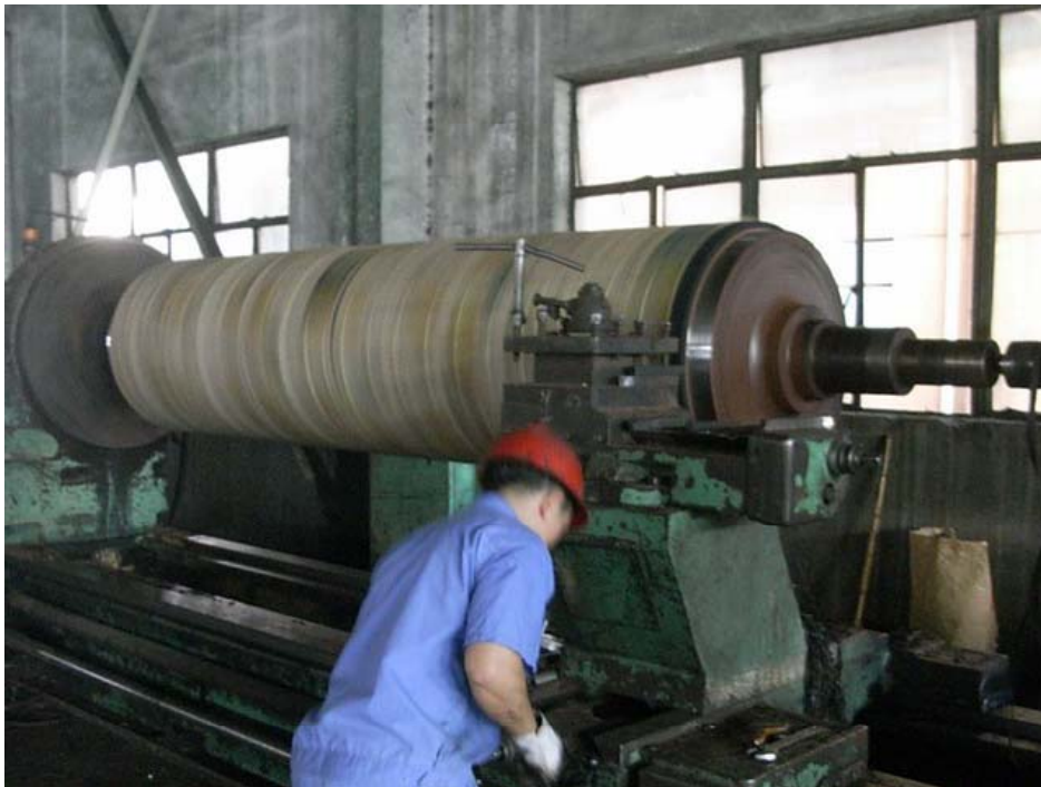
CNC grinding machine Dia.2m x Length 12m